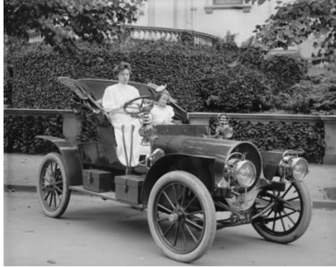
Figure 1: 1907 Franklin Model D roadster.